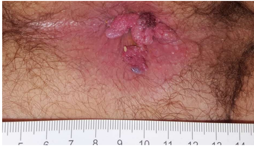
Figure 2 A