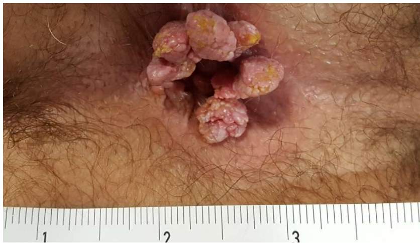
Figure 2 B