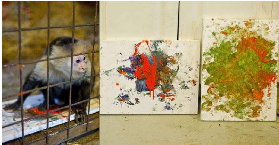
Fig 5. The Painting Monkey (You Tube, see reference 12).

But art is a very important means of communication and it may be also utilized as rehabilitation with good success. This is art therapy or better indicated as expressive not verbal therapeutic activity, better definition than art therapy, since it does not imply an esthetic evaluation, that is not required for the therapeutic finalities. The first ateliers of drawings in psychiatric hospital have been in USA since 1920 and after they have been organized everywhere also outside the Psychiatric Hospitals. In Italy, we remember the important experiences of the Trieste Psychiatric Hospital, The Marco Cavallo, and many others. Art therapy is further organized as a discipline linked with other rehabilitation methods (psychotherapy, horse-therapy, work-therapy, music-therapy, etc).