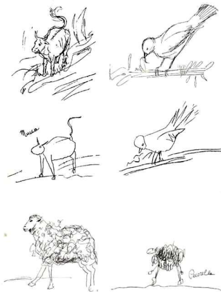
Fig 2. Drawings from a 6 old children, with selective mutism before therapy showing a very good graphic performances, not related with the age , and one year after, when he was able to have a normal verbal communication but the very good graphic capacity have been lost (Reda et al, In Federico A, 1998) (6).

These findings were also reported by Selfe, L. (1977) (7) in autism.