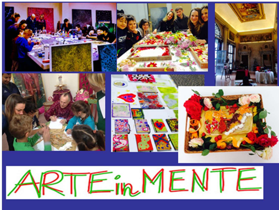
Fig. 6. ARTEinMENTE. Pictures during a workshop with ADHD children.