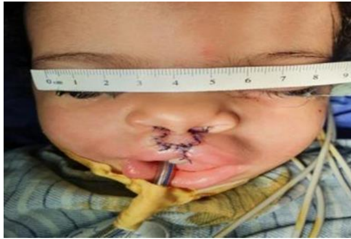
Figure (6): the first patient following the second stage.