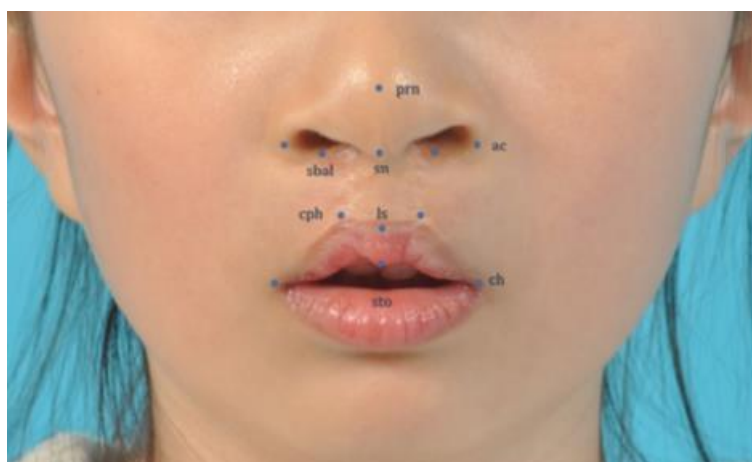
Figure (3): Shows the points we used for frontal photometrical analysis.(10)