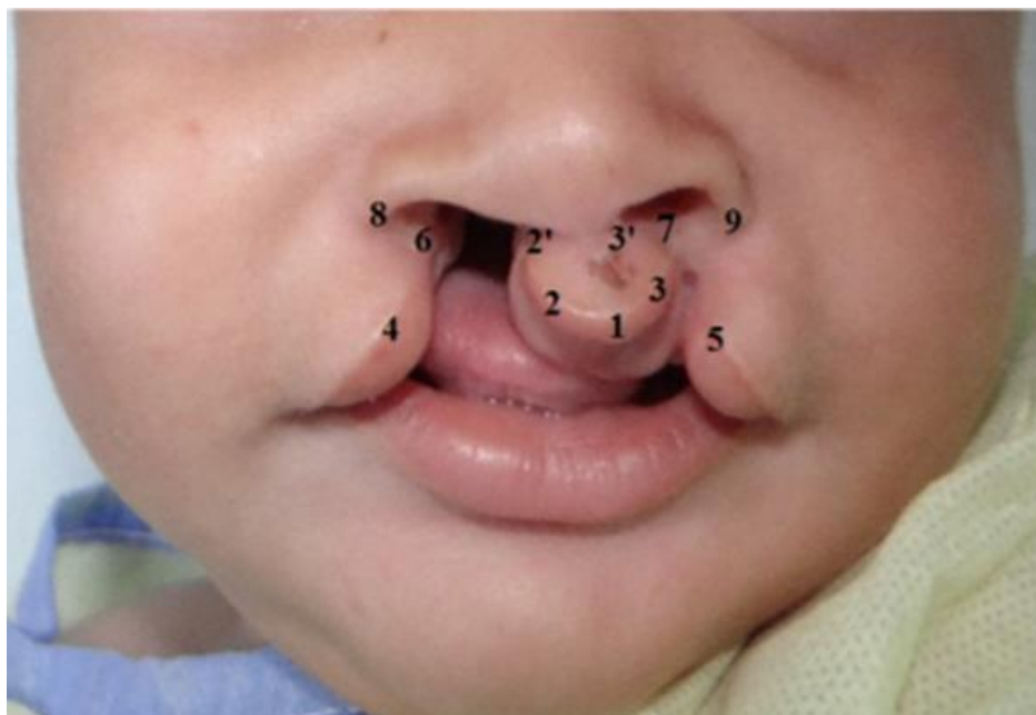
Figure (1): Shows the marking landmarks of the first stage

We infiltrated the lip with local anesthetic at points 2,3,4 and 5 (2% xylocaine with 1/200,000 adrenaline).