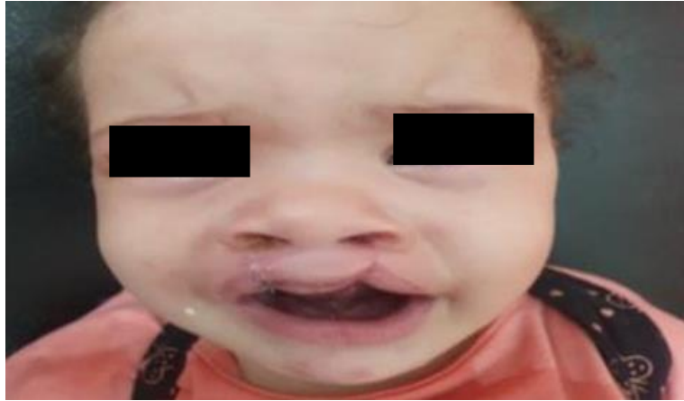
Figure (5): First patient following the first stage.