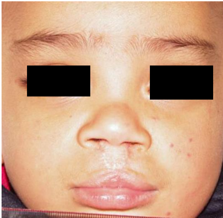
Figure (11): the same last patient 6 months after the second stage.