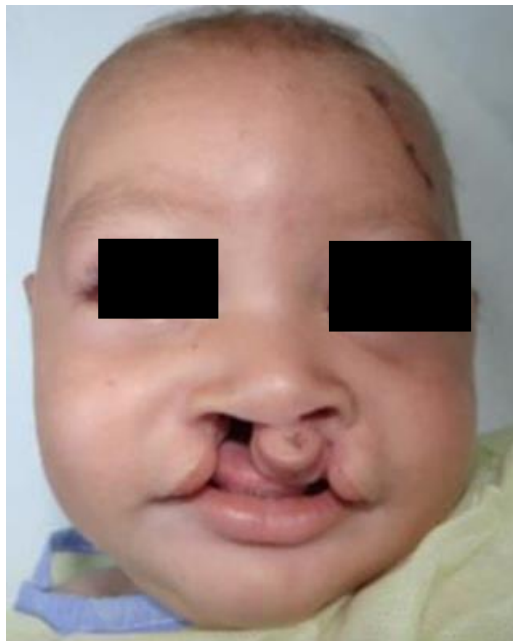
Figure (7): the second patient before the first stage.