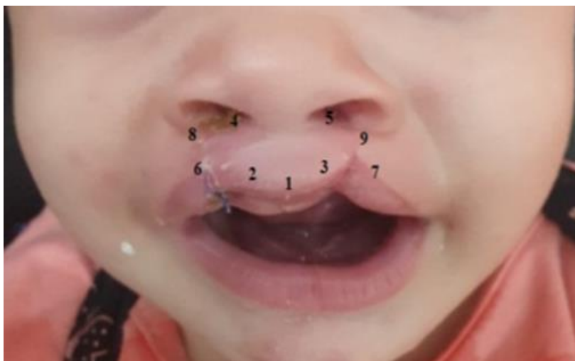
Figure (2): the landmarks for the second stage.